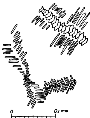
FIG. 5. — Leaf-like skeletons of basaltic hornblende in the main type of lava of the Leucite flows. Specimen S. 45.

that are marked I and II in figure 4-A. The boundaries between the sectors are sharp but irregular. The position of extinction is slightly differing for the two pairs of sectors. A preliminary universal stage study revealed the fact that the crystallographic c -axes of the both pairs of sectors are closely, but not exactly, parallel with each others. In both pairs of sectors a number of relatively thin and very sharp lamellae are seen that lie parallel with the outer faces of the clinopyroxene crystal. These lamellae seem not to represent alternate zones of differing chemical compositions. Between crossed nicols the lamellae found in sector I extinguish simultaneously with sector II and the lamellae occurring in sector II show an extinction position parallel with that of sector I. Accordingly, the lamellae occurring in sector I have the same orientation as sector II and vice versa. An X-ray